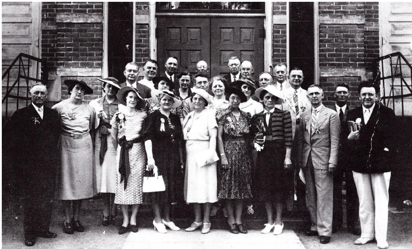
NBHS CLASS OF 1909- 25 TH REUNION